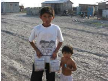
Children in Mexico holding the KAH food packets.

Acting as a part of the Mission Committee, an average of 10,000 meals a month are delivered by our volunteers to benevolence partners such as CCSC, Kid's Meals, and Bethel Ministry. More than 2 tons of food packages have been sent to orphanages and impoverished communities in Matamoros, Mexico.