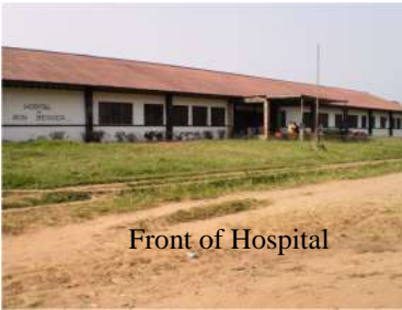
Front of Hospital

IMCK is a Christian primary health care facility and medical education center. Its services are centered at the Good Shepherd Hospital, which is a 140 bed facility about 10 miles outside of Kananga, in the Kasai Province of the DR Congo, and at PAX, a clinic located in the city of Kananga, that has 20 beds. General medicine, surgery, ophthalmology, pediatrics, gyn/obstetrics, dental services, radiology and lab services are provided. This faith-based organization has been in operation for almost 60 years. It is the largest Presbyterian affiliated hospital in the Democratic Republic of Congo.